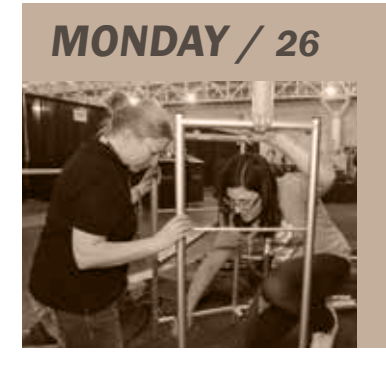
Exhibit Hall Setup